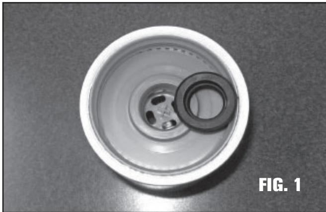
Check for detached filter grommet.

A second condition involves technicians complaining of a difficult fuel filter installation. A frequent complaint is the filter will not thread onto the filter adapter. The installer is usually certain that damaged filter housing threads are the reason for the installation difficulty. The culprit is usually a grommet from the previous filter that is still attached to the filter adapter, making it impossible to install the new filter (see Fig. 1).